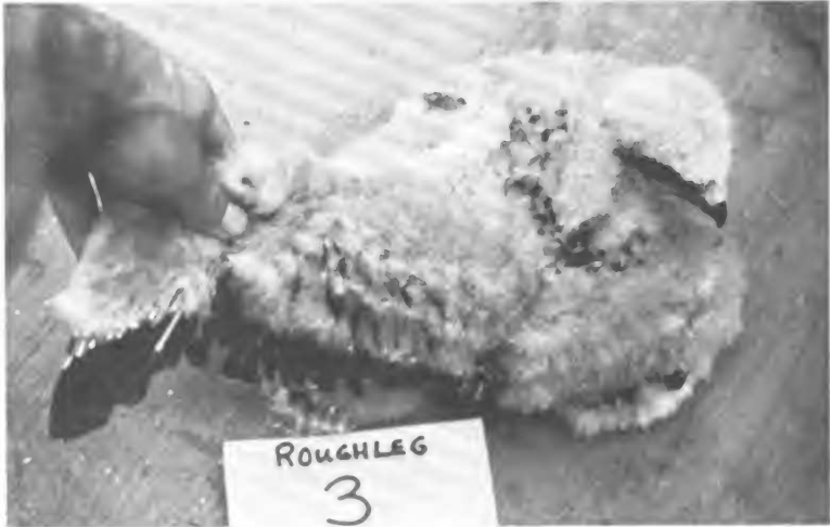
Figure 2. Three-week-old Rough-legged Hawk losing second coat of down as feathers push out of their sheaths.